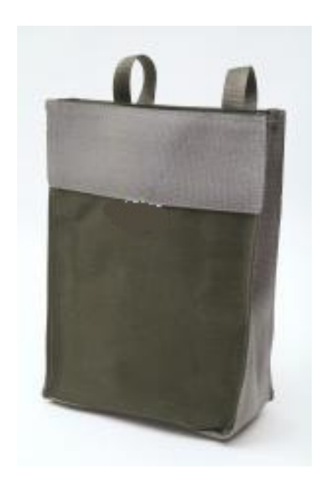
Green Tool Bag

Deep Canvas Tool Bag Front Pocket Nylon Straps and Buckles