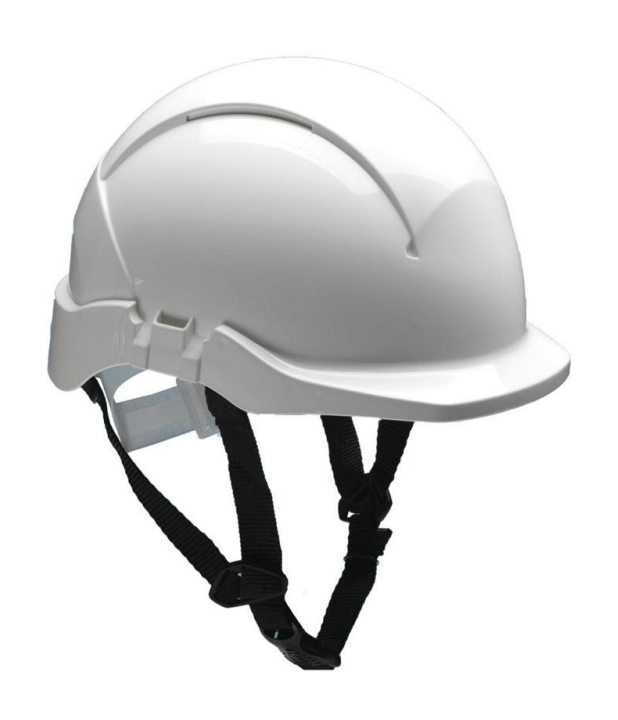
Linesman Safety Helmet

The Centurion Concept Linesman Safety Helmet has a reduced peak with high security head harness and quick release chin strap. Certified to: EN397, -40 Degrees C, LD, EN50365. ANSI Z89 1-2003 type 1, class E (20,000V a.c.)