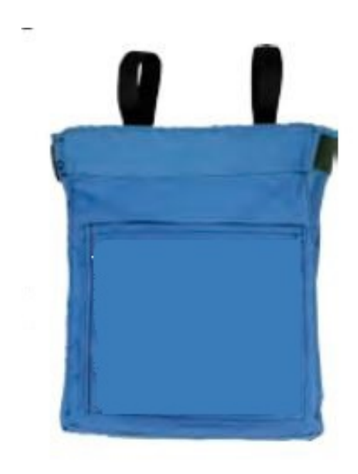
Canvas Tool Bag

Deep Canvas Tool Bag Front Pocket Nylon Straps and Buckles