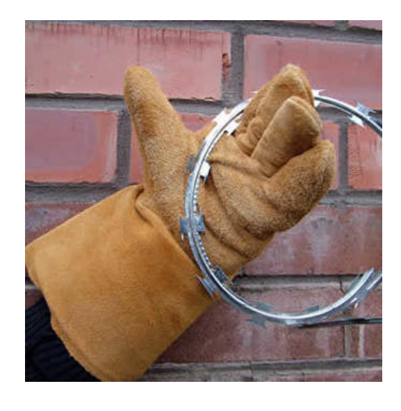
Gloves For Barbwire

Excellent Wet & Dry Grip Durable Latex Palm Coating Enhanced Puncture & Abrasion Resistance Approved to EN388-3.5.4.3