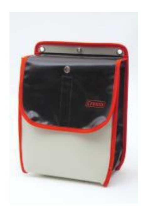
Cresto Tool VinylBag

Green Heavy Duty Canvas Deep Tool Bag 30cm x 36cm x 10cm