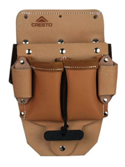
Cresto Leather Tool Frog 7 Piece

Cresto Vinyl Tool Bag Deep With Flap Cover 28cm Tall x 25cm Wide x 10cm Deep