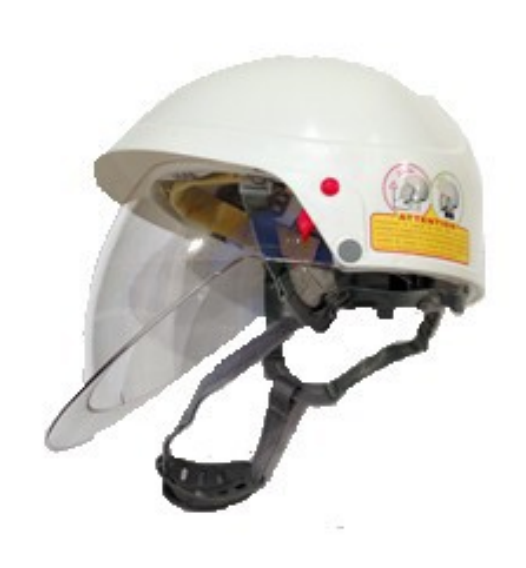
Full Face Visor Anti Flash Full Face Visor

Idra Full Face Helmet with Intergral Visor