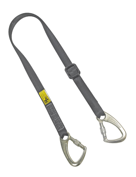
Work Positioning Adjustable Lanyard

Lanyard suitable for work positioning or as a component in a fall protection system 1.5m Adjustable